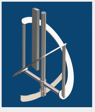
PARAVISC with baffle