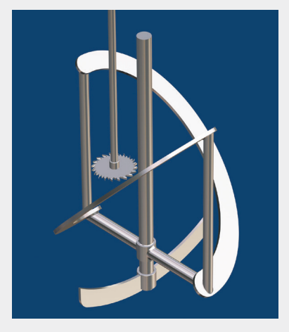
PARAVISC with off-center disperser