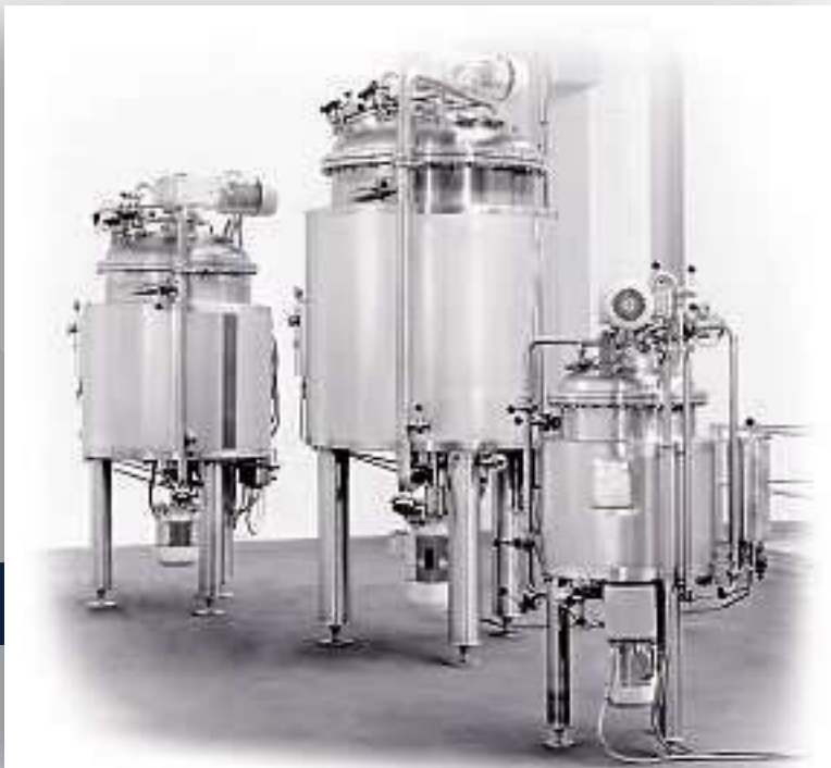
EKATO UNIMIX SRE 100, 500, 1000