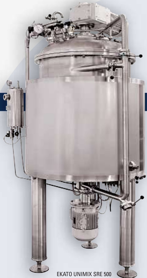
EKATO UNIMIX SRE 500

The standardized series of mixers type SRE has been designed and premanufactured to reduce investment costs and delivery time. SRE incorporates special features assuring safe and economical production for a wide variety of products and viscosities.